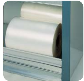
Bin Front Bin fronts can be bolted to the front or rear face of the shelf to secure items.