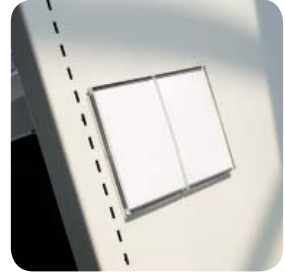
Sign Holders Sign holders are used to identify aisles