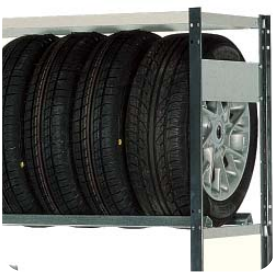
Tyre Shelf Used for tyres and wheels.