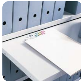
Pull-Out Reference Shelf Pull-out reference shelves provide an instant work top.