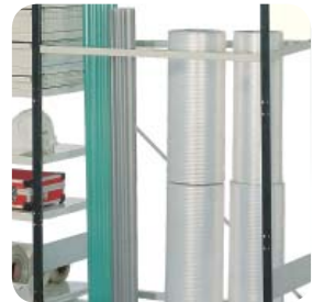
Open Shelf For vertical storage of long and awkward items, subdivided by rods.