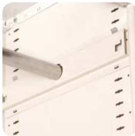
Coat Rail Coat rail for clothes and other hanging devices.