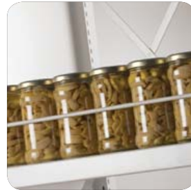
Front Stop Rod used to create a stop along the front of the shelf.