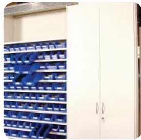
Lockable swing doors Door kits to secure contents of shelving.