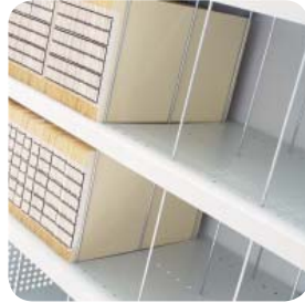
Rod Dividers Divide compartments into a number of open bar partitions.