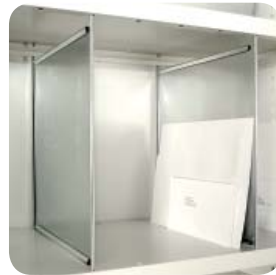
Binning Dividers Create pigeon holes with bright silver binning dividers.