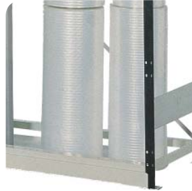
Plinths Provide a clean smart finish and prevents small objects from running under the shelf.