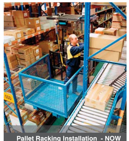
Pallet Racking Installation - NOW

widened the scope of the Company's operations, and gave us an insight into larger and more complex storage and materials handling situations.