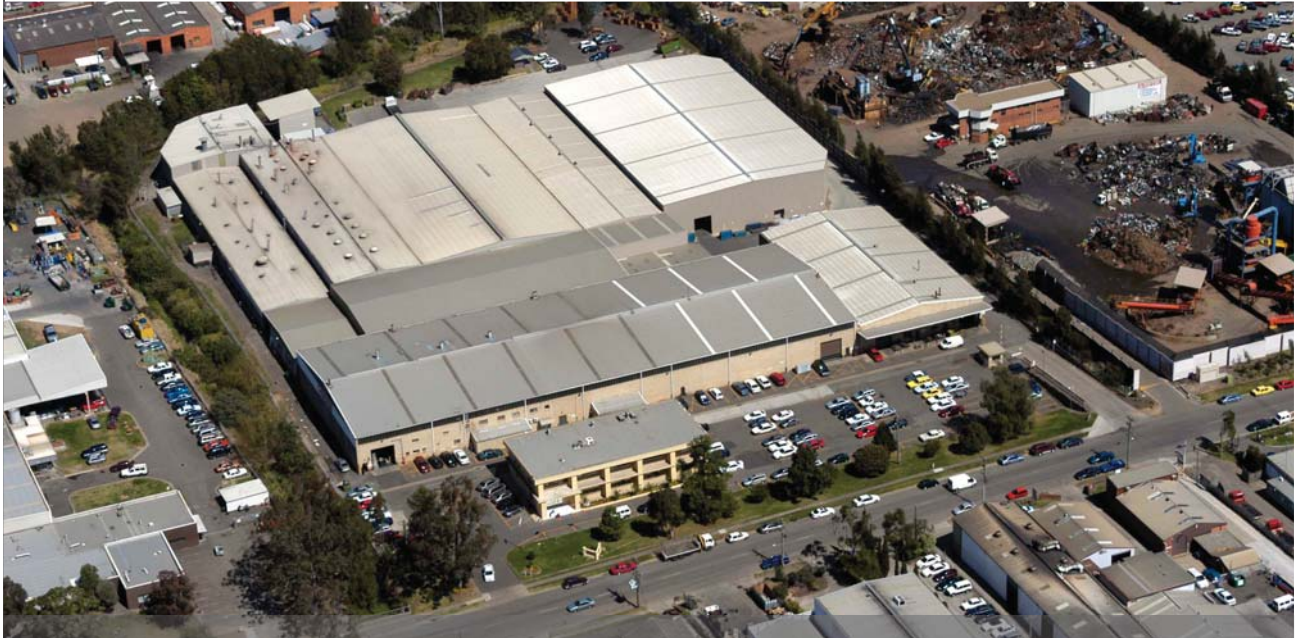
Head Office - Kings Park

It became clear that the success of Dexion depended on a change of emphasis of its operations, a change from product selling to solving customer's problems.