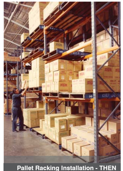
Pallet Racking Installation - THEN

Why the change? The growing use of pallets led Dexion to introduce a pallet storage system. This was in anticipation of the growing awareness throughout the industry of the economic advantages of faster and more efficient materials handling. Selling the new product vastly