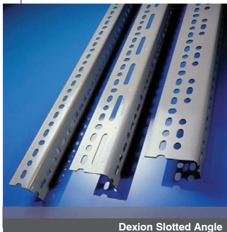
Dexion Slotted Angle

taking place in Belgium in 1952. By 1958 all production had transferred to a 200,000 sq ft factory on a 15 acre site at Hemel Hempstead. By the late 1960's Dexion products were being made or sold in over 100 countries.