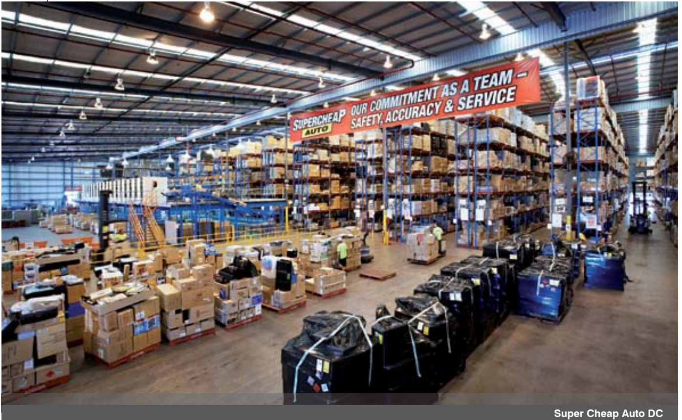
Super Cheap Auto DC