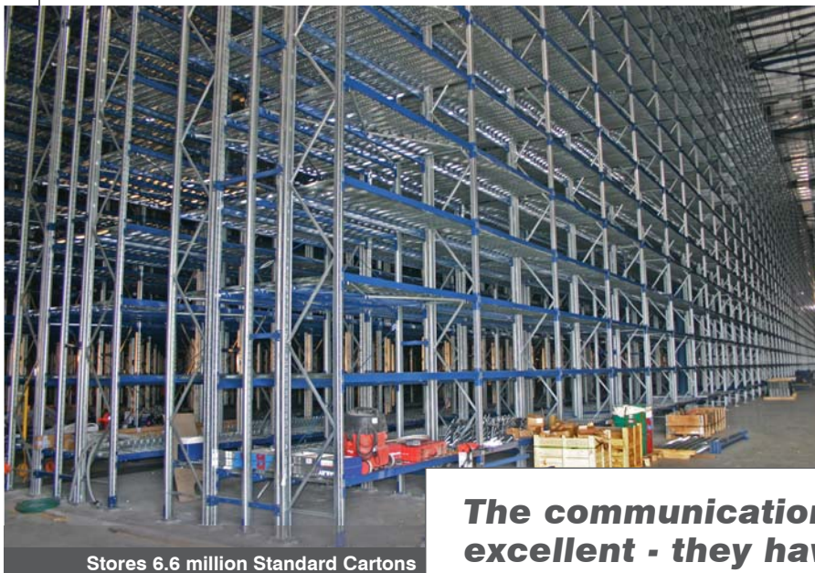
Stores 6.6 million Standard Cartons

The Greystanes facility is one of the largest Information Centres in the Southern Hemisphere. Once complete, it will have in excess of 4,000 bays of racking with 21 levels of storage to cater for 6.6 million standard cartons. The rack system includes 48 aisles each 130 metres long. The storage system features a 25 metre rack system serviced by 12 Racking Access Vehicles, 6.2 kilometers of crane rail, 406 kilometers of racking uprights and 252 kilometers of racking beams.