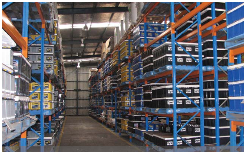
Warehouse Before Reconfiguration

The Drive-In racking occupied 67% of the floor space but provided low accessibility to product, with immediate access to only 25% of product stored.