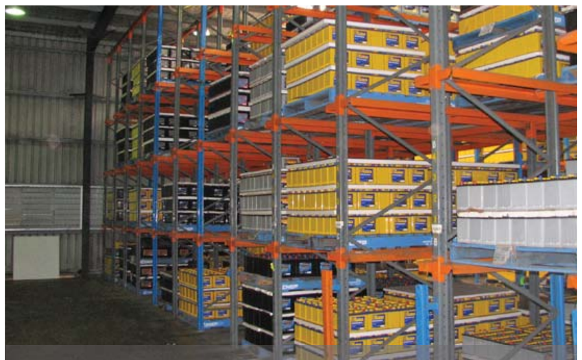
Warehouse Before Reconfiguration