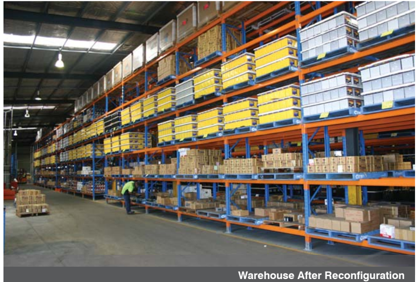
Warehouse After Reconfiguration

The Dexion design has increased the number of pallet positions by almost 50%. In turn, this has greatly increased the utilisation of floor space, increased the number of picking locations with spare locations for new products, and ultimately increased productivity.