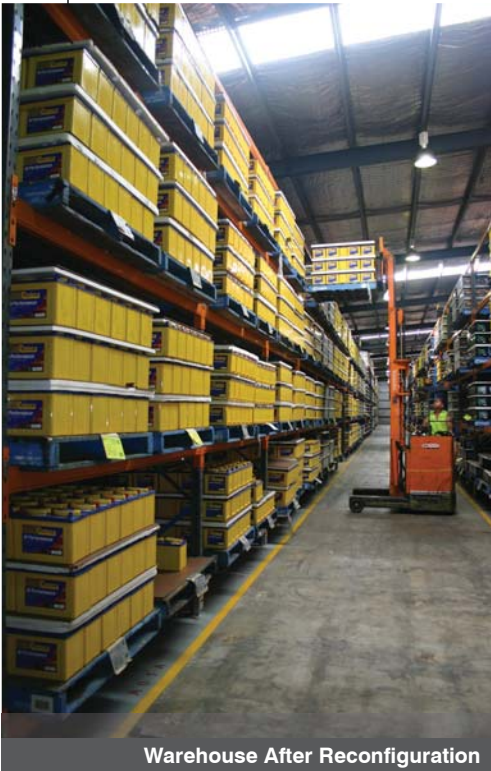
Warehouse After Reconfiguration

The Dexion design has increased the number of pallet positions by almost 50%. In turn, this has greatly increased the utilisation of floor space, increased the number of picking locations with spare locations for new products, and ultimately increased productivity.